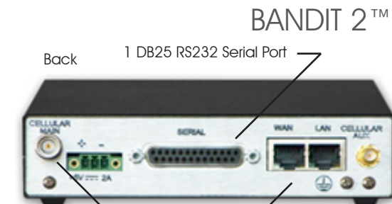
1 Optional Wireless Cellular and 2 10/100 Base TX Ethernet Ports